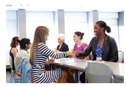
Mentorship Program

On Monday, May 27<sup>th</sup> mentors and mentees were brought together for a unique networking opportunity. In speed dating-like fashion, mentees had