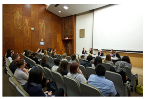
Public Health Alumni Association Spring Speaker Panel